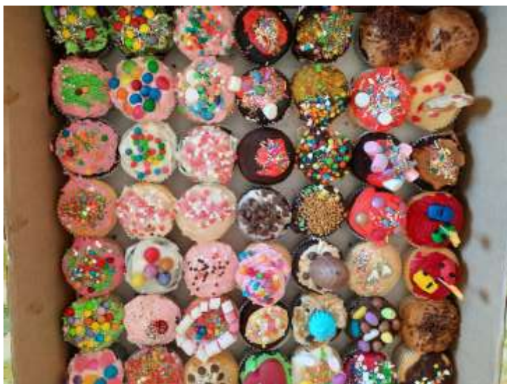
Finger licking good!