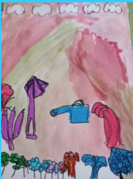
"My responsibility is to water the garden." Mika-eel Jakoet