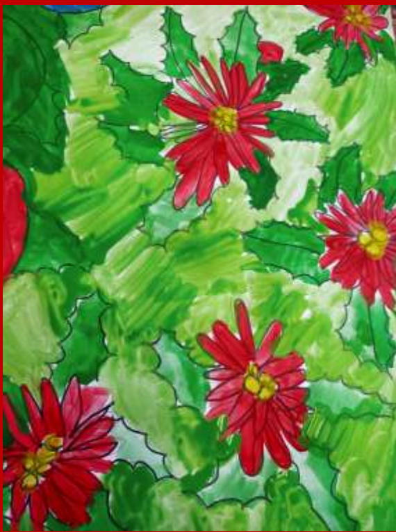
Rhees Oliver Gr 3e