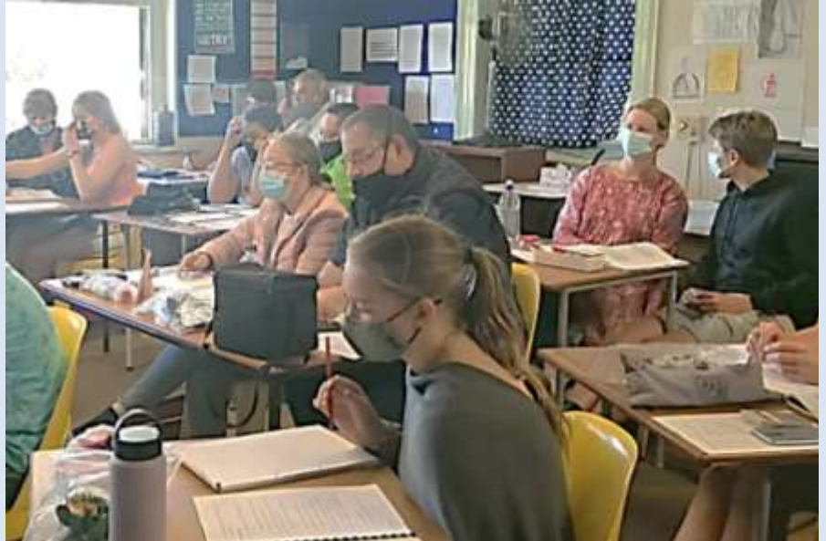
Everyone listened attentively.