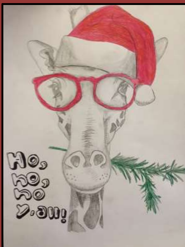
Luca Boshoff Gr 7A