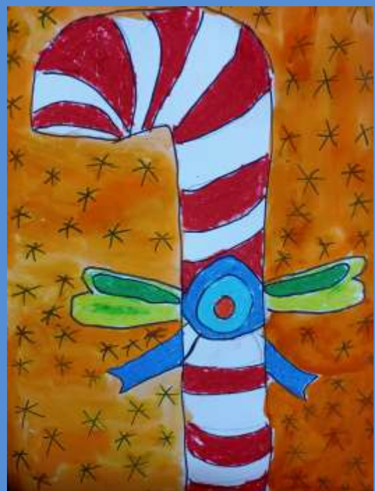
Judah Visser Grade 3e